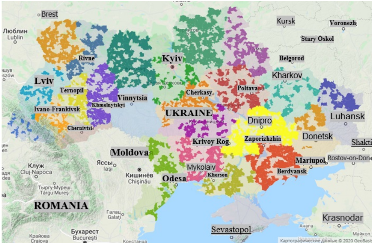
Fig. 2. The number of united territorial communities in Ukraine (September 2020)

problems, first of all, lies in the representatives of local authorities, whose activities ensure the viability of the territory. According to official data, as of September 2020, 1469 communities have been created (Fig. 2).